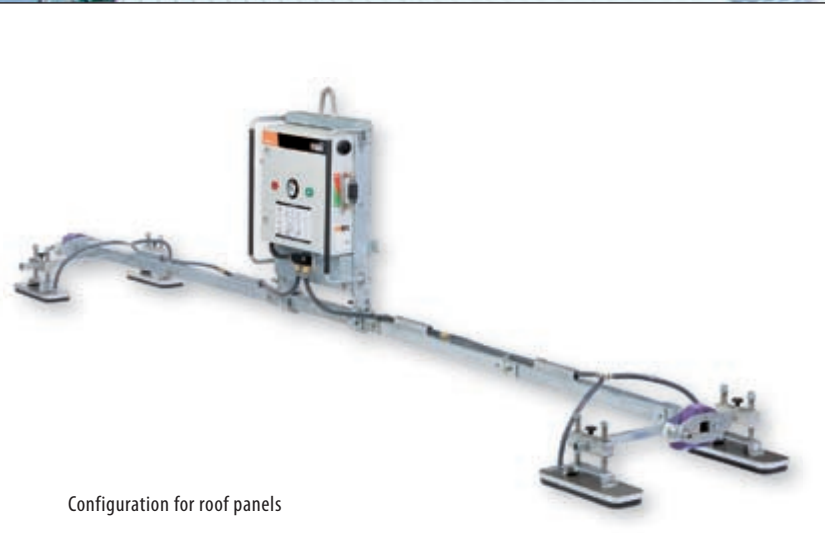
Configuration for roof panels